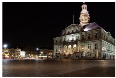
THE TOWN HALL

square (10 minutes) or take a bus. The bus station is immediately outside the station exit (no need to go through the main Station entrance hall – just go directly outside the station from the platform). Bus number 1, 3, 10, 53 all go to the Market (stopping by the statue of the man holding a flame) and run every few minutes until 19.00, after which there are 2 busses an hour. The Mabi Hotel is at Kleine Gracht 24, a very small road that runs off the Market square, along the left side of the Hotel de la Bourse, which is behind the Town Hall.