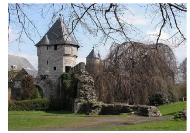
A SECTION OF THE OLD CITY WALLS